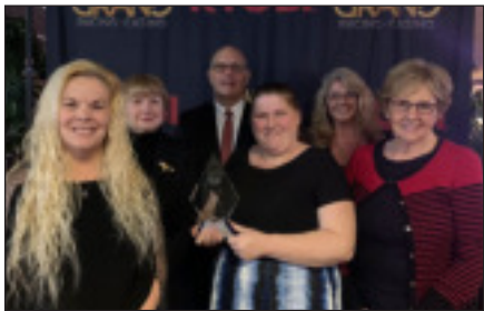
Non-Profit Champion Shelby County Pantry Pals