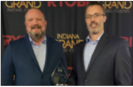
Small Business Champion Brammer & Yeend Professional Corporation