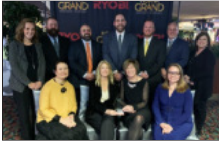
Large Business Champion Shelbyville Central Schools